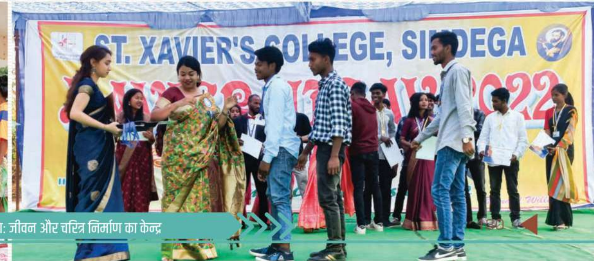
संत जेवियर्स कॉलेज, सिमडेगा: जीवन और चरित्र निर्माण का केन्द्र