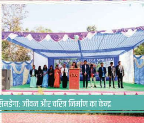
संत जेवियर्स कॉलेज, सिमडेगा: जीवन और चरित्र निर्माण का केन्द्र